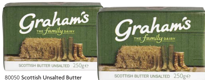
80050 Scottish Unsalted Butter