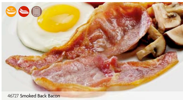
46727 Smoked Back Bacon