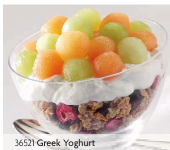
36521 Greek Yoghurt