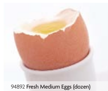
94892 Fresh Medium Eggs (dozen)