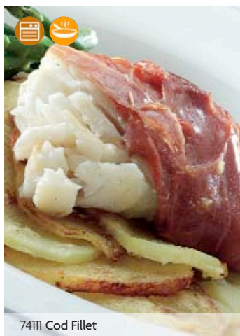
74111 Cod Fillet