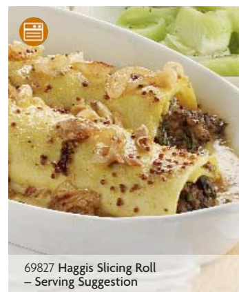
69827 Haggis Slicing Roll - Serving Suggestion