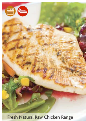
Fresh Natural Raw Chicken Range