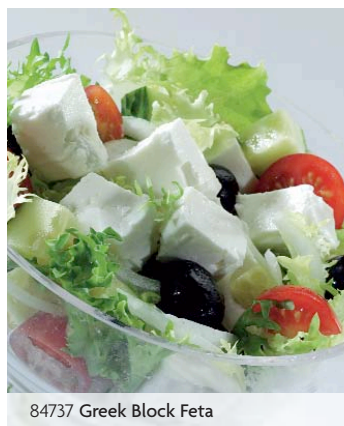
84737 Greek Block Feta