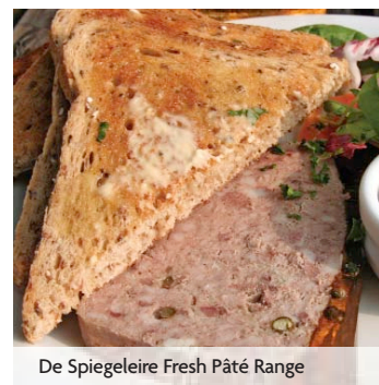
De Spiegeleire Fresh Pâté Range