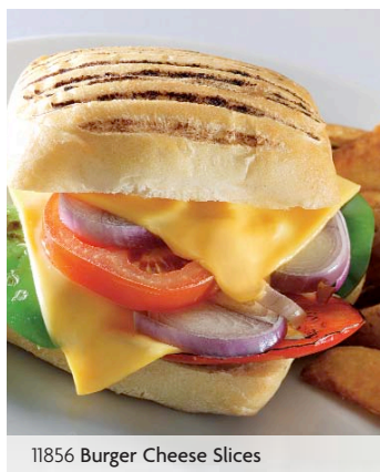
11856 Burger Cheese Slices