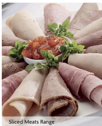
Sliced Meats Range